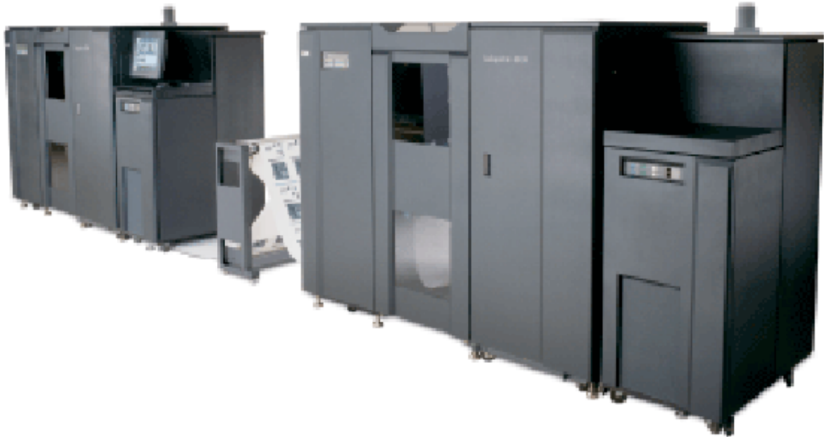
Figure 45. Infoprint 4100-HD1/HD2 and 4100-PD1/PD2 Printers

Table 139 summarizes the printer characteristics for the Infoprint 4100-HD1/HD2 and 4100-PD1/PD2 printers.