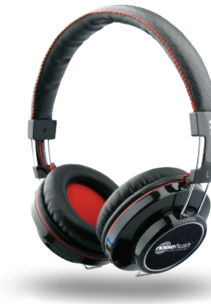
H-0002 BT Headphone