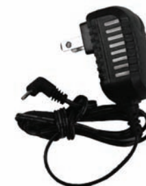
1 x AC Charger Adapter