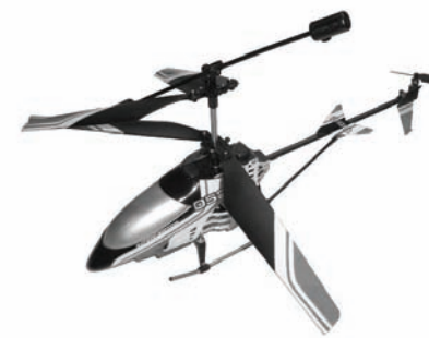
1 x HELICOPTER