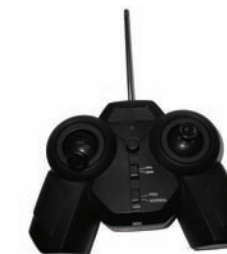
1 x CONTROLLER