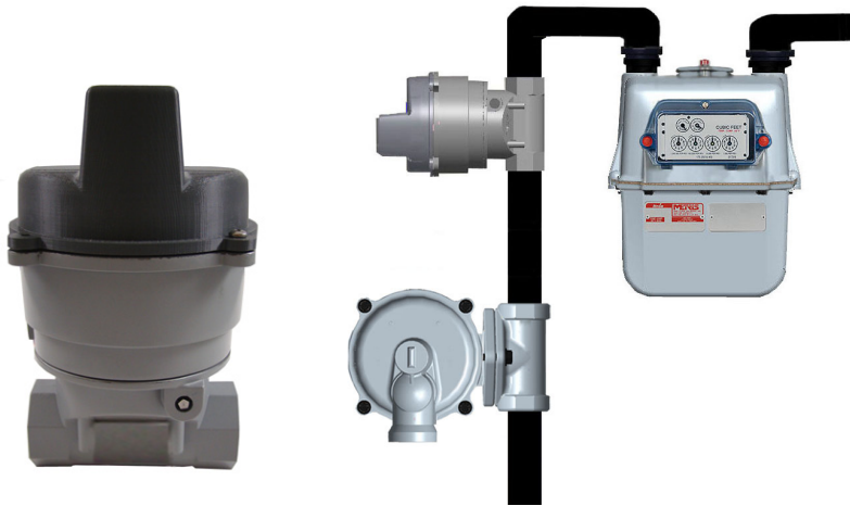
Itron GasGate RD

To ensure safe and efficient operation of this product, Itron strongly recommends installation by a qualified professional.