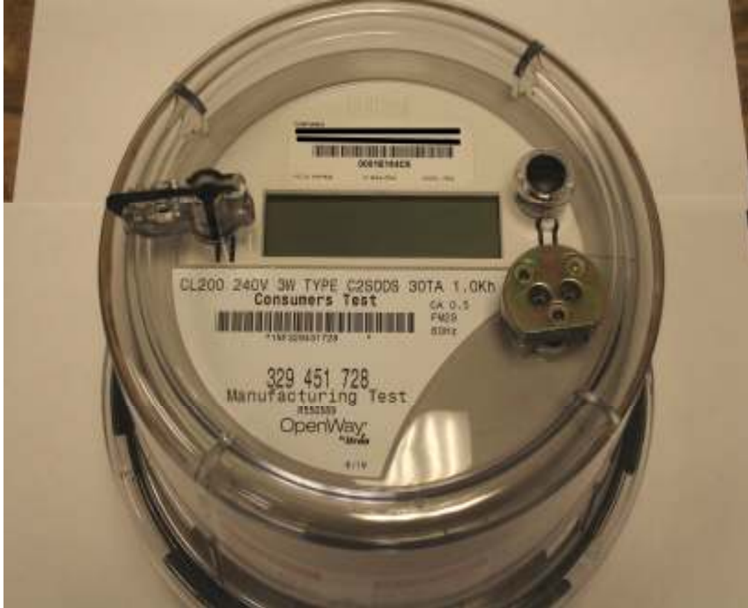
Complete Host Meter