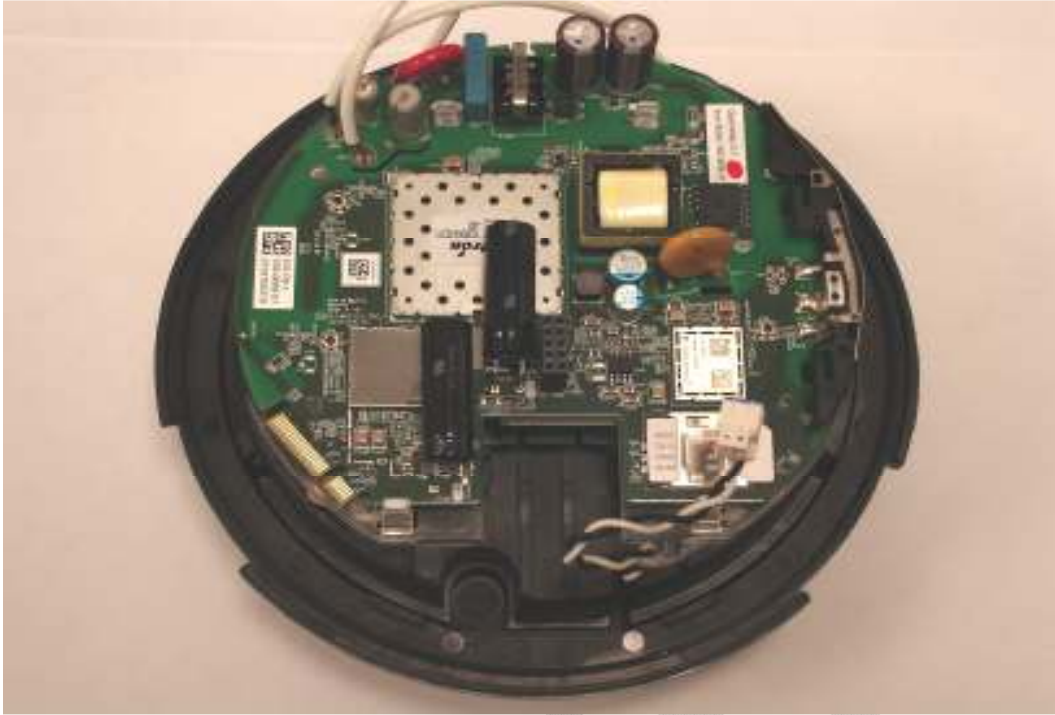
Meter Base with CAT1 and register boards installed