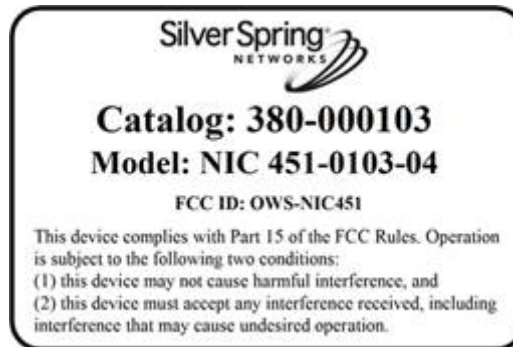
Figure 3. Sample FCC ID label for the streetlight NIC

Figure 4 shows the placement of the labels.