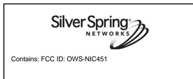
Figure 5. Sample FCC ID label for devices containing a streetlight NIC (NIC 45x)

In the latter case, a copy of these instructions must be included in the application for equipment authorization.