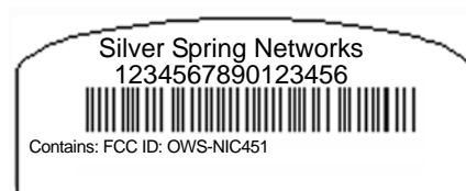
Figure 2. Example of NIC address label for 45x

Figure 2 shows an example of the NIC address label, which is consistent with FCC requirements set forth in Chapter 2 FCC and Government Guidelines , and contains the Silver Spring Networks corporate name and NIC EU-64 address.