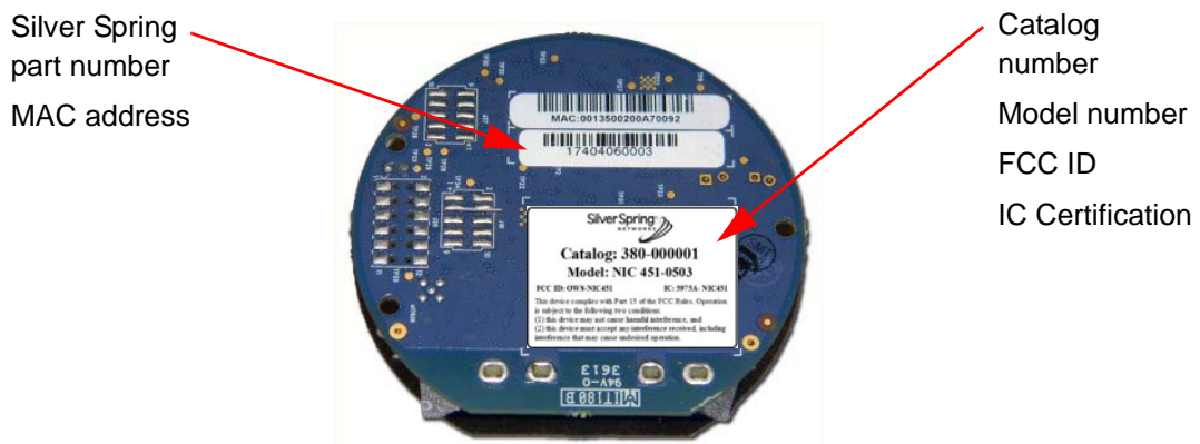
Figure 4. Label locations on the Silver Spring streetlight NIC

Figure 4 shows the placement of the labels.