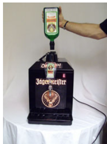
Figure 11 - Install

Screw on tightly but do not over tighten. A correctly installed bottle stopper will ensure a tight seal between the bottle stopper neck and the bottle.