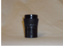
Figure 8 – Screw On Bottle Stopper

IMPORTANT NOTICE: WHEN REPLACING EMPTY BOTTLES - DO NOT DISCARD OR THROW THE BOTTLE STOPPERS AWAY. THE BOTTLE STOPPERS ARE TO BE REUSED AND ARE NOT DISPOSABLE!