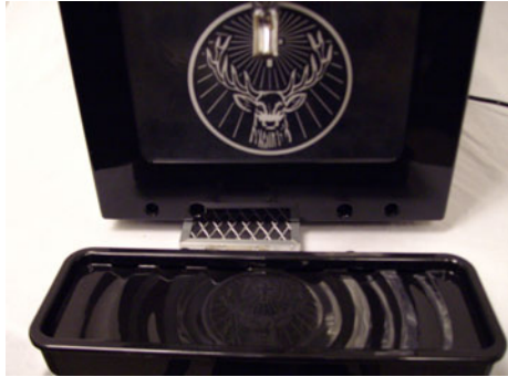
Figure 4 - Front View – Filer and Drip Tray