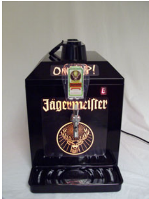
Figure 7 – Handle In place

The Model JEM uses a fully functional draft beer type faucet and requires an acrylic handle. In the accessory bag, locate the acrylic handle and screw it on the top portion of the faucet. DO NOT OVERTIGHTEN. The finger grooves on the back of the handle should be facing to the rear of the machine. Use the adjustment on the faucet to tighten in place. Once installed correctly, the flat portion of the handle will face the user.