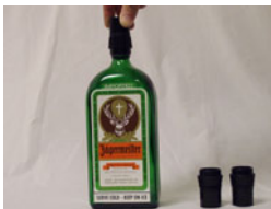
Figure 10 - Seated

Remove the cap from the Jägermeister Bottle and position the Bottle Stopper above the Bottle.