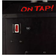
Figure 14 - Rear View

WARNING THE POWER SWITCH MUST BE TURNED "OFF" DURING CLEANING.