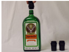
Figure 9 – Screw On

DO NOT DISCARD OR THROW THE BOTTLE STOPPERS AWAY. THE BOTTLE STOPPERS ARE TO BE REUSED AND ARE NOT DISPOSABLE!