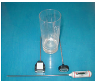
Figure 16 Typical Digital Thermometers and Glass

If you suspect the Jägermeister Tap Machine® is not cooling properly, First CLEAN THE FILTER AT THE FRONT OF THE MACHINE. Your JEM Jägermeister Tap Machine® will not chill properly with a dirty filter. Before performing any temperature testing, remove and clean the filter. After you clean the filter, you must wait at least 30 minutes before performing any further temperature testing. Then measure the temperature of the Jägermeister as follows: