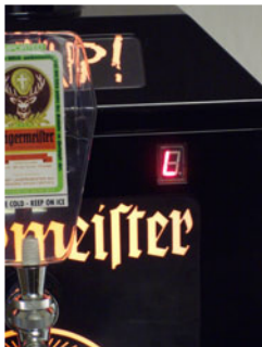
Figure 6 – Level Indicator

These should always be sealed closed when a bottle is not present.