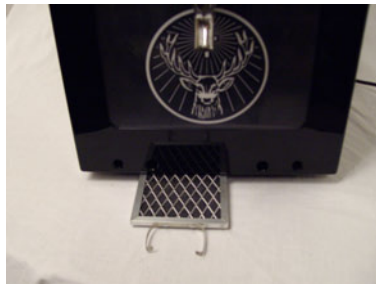
Figure 15 - Clean Filter

Remove and clean the drip tray and air filter at the front of the machine. The filter may be rinsed in warm water and allowed to dry for a few minutes. Replace the filter in the filter holder at the front of the machine.