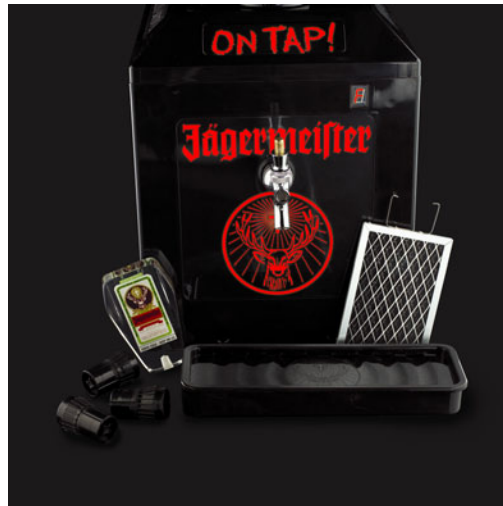
Figure 1 - Items Supplied