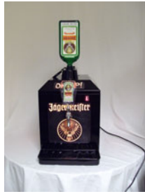
Figure 12- In Place