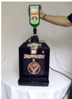
Figure 13- Remove

Slowly insert the bottle stopper into the hole of the bottle well. Push down slightly and allow the bottle to rest inside the bottle well. The weight of the bottle will keep the bottle securely in the bottle well. If the bottle is slightly turned, you can turn the bottle up to 1/8 turn to line up with the front of the machine. Repeat for All Bottles.