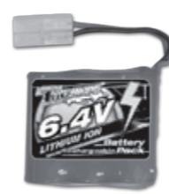
6.4V Lithium Ion Rechargeable Battery Pack