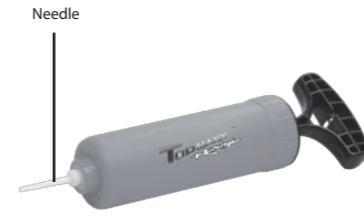
Tyre Inflation Air Pump and Needle