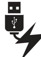
USB Adapter Cable