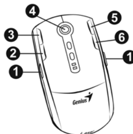
Media Center mode