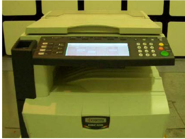
Overview of printer

B5J-0452 is attached in printer according to the following photo 1 and 2.