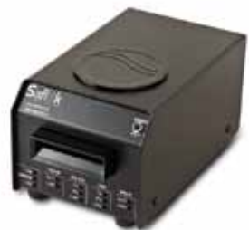
Type 7 Encoder