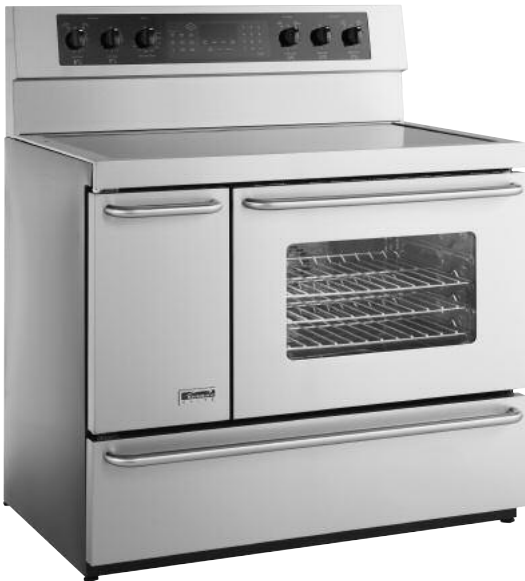
Kenmore Elite 40-Inch Self-Clean Radiant Range