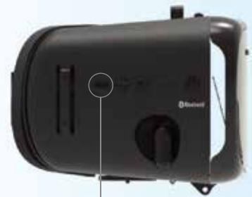
Micro USB Port for Charging

Via AC Adapter/Wall Charger: Using the provided Micro USB cable, connect your VR Headset (Micro USB port) to the AC Adapter (USB port).