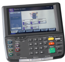
Newly designed, easy-to-use large color touch screen control panel