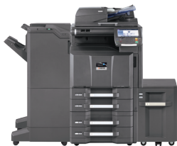
Shown with optional 175 sheet DSDP, 500 x 2 sheet paper trays, 3,000 sheet side LCT and 4,000 sheet finisher