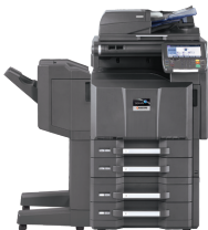
Shown with optional 175 sheet DSDP, 500 x 2 sheet paper trays and 1,000 sheet finisher