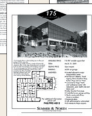
Mixed Text/Photo Mode

Various Imaging Modes capture every detail of your original with amazing results.