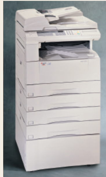
At right... KM-1530 shown with optional 70 Sheet Document Processor, three 250 Sheet Paper Drawers, and Stand.

Clearly marked Control Panel plus Auto Paper Selection, Auto Magnification Selection, Auto Exposure and more takes the guesswork, and waste, out of copying.