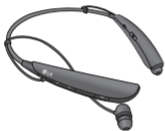
LG TONE+™ HBS-750