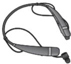
LG TONE PRO™ HBS-760