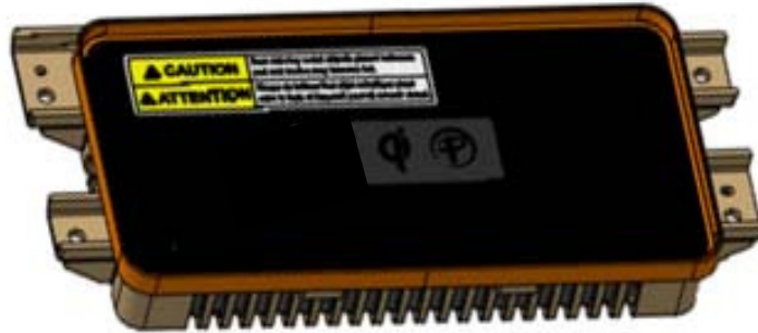
WC900 Wireless charger Unit