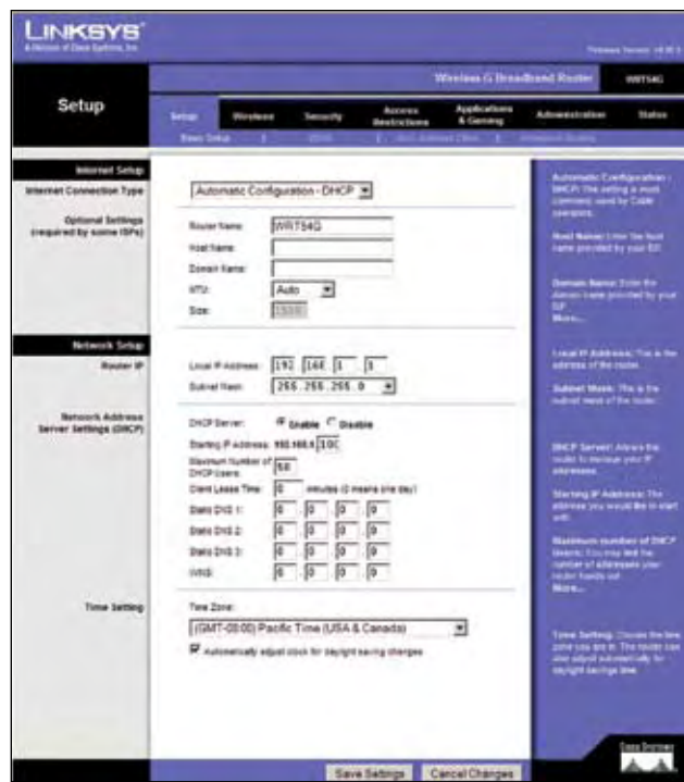
Setup > Basic Setup

The first screen that appears is the Basic Setup screen. This allows you to change the Router's general settings.