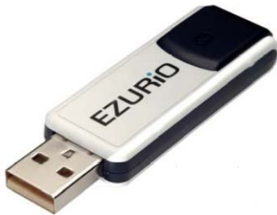
USB BLE Dongle - Single Mode