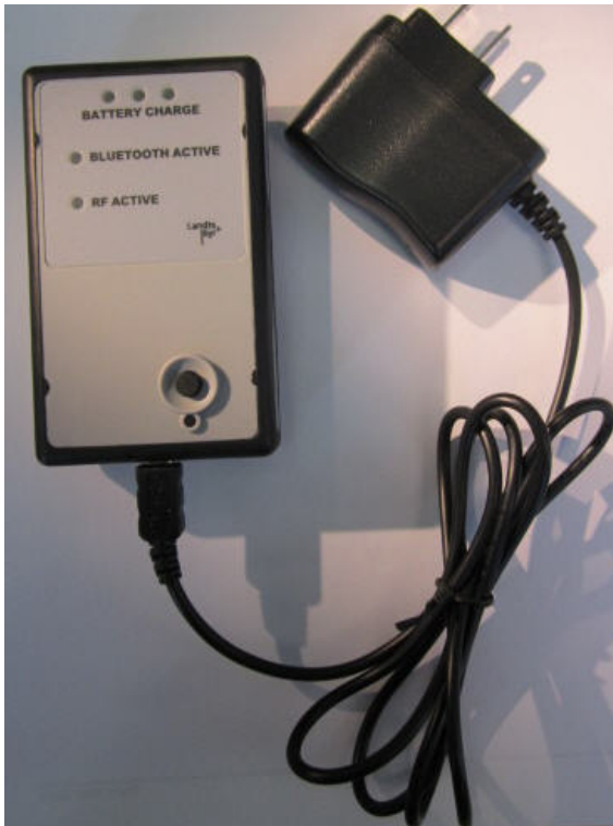
Figure 2. Field Tool Adapter (Comms Adapter) Kit

The Field Tool Adapter (Comms Adapter) kit includes a battery charger.