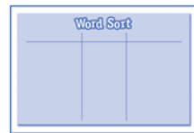
Back of mat