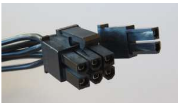
6+2 pin PCIe Power Connector