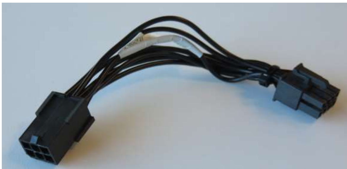
6-pin PCIe to 8-pin PCIe Converter, 100mm (FRU = 00XL159)