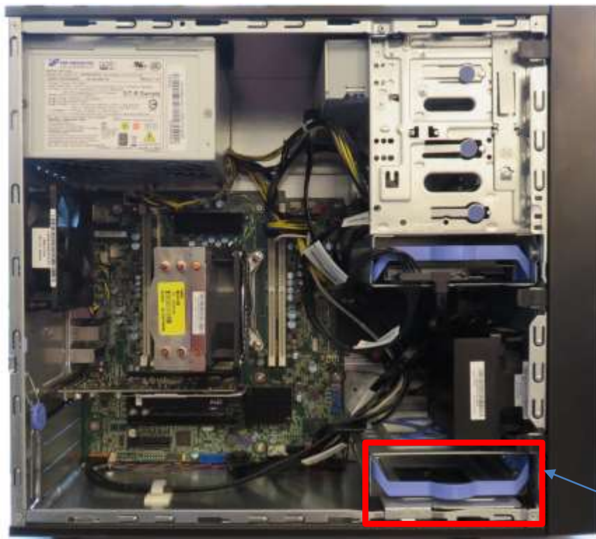
Figure 4 - P520c Lower HDD Bay Removal for Double-Wide Graphics Cards

This HDD bay must be removed for installation of double-wide full length graphics cards.