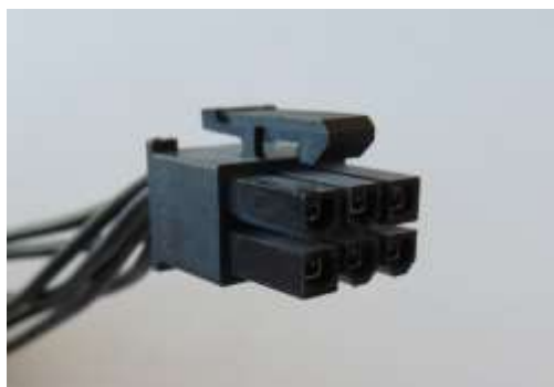
6-pin PCIe Power Connector