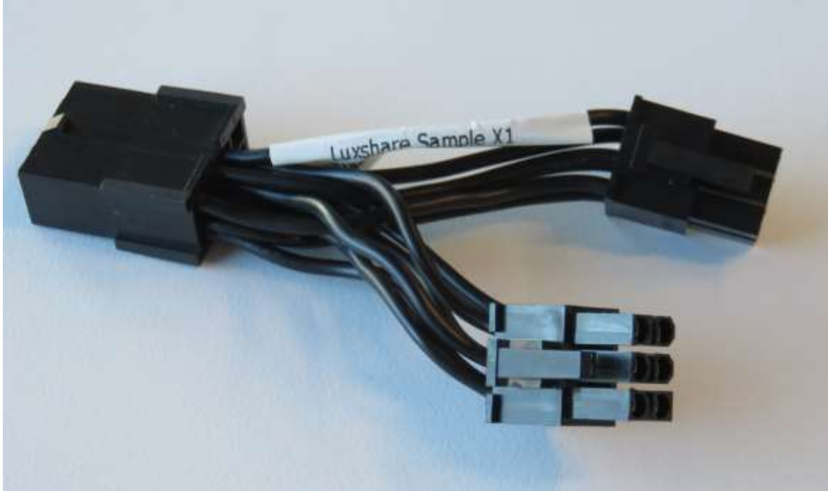
8-pin to dual 6-pin PCIe Splitter, 50mm (FRU = 04X2387)