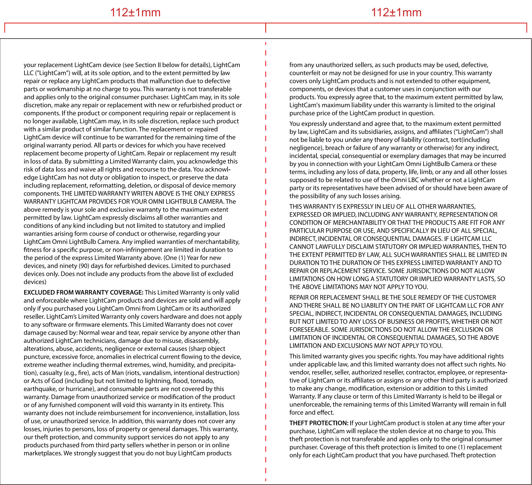
内页 ( 第2页 ) Inner ( page 2 )