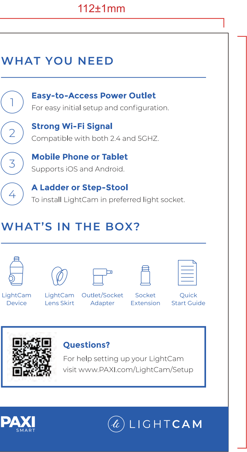
封面 ( 第1页 ) Front cover ( page 1 )