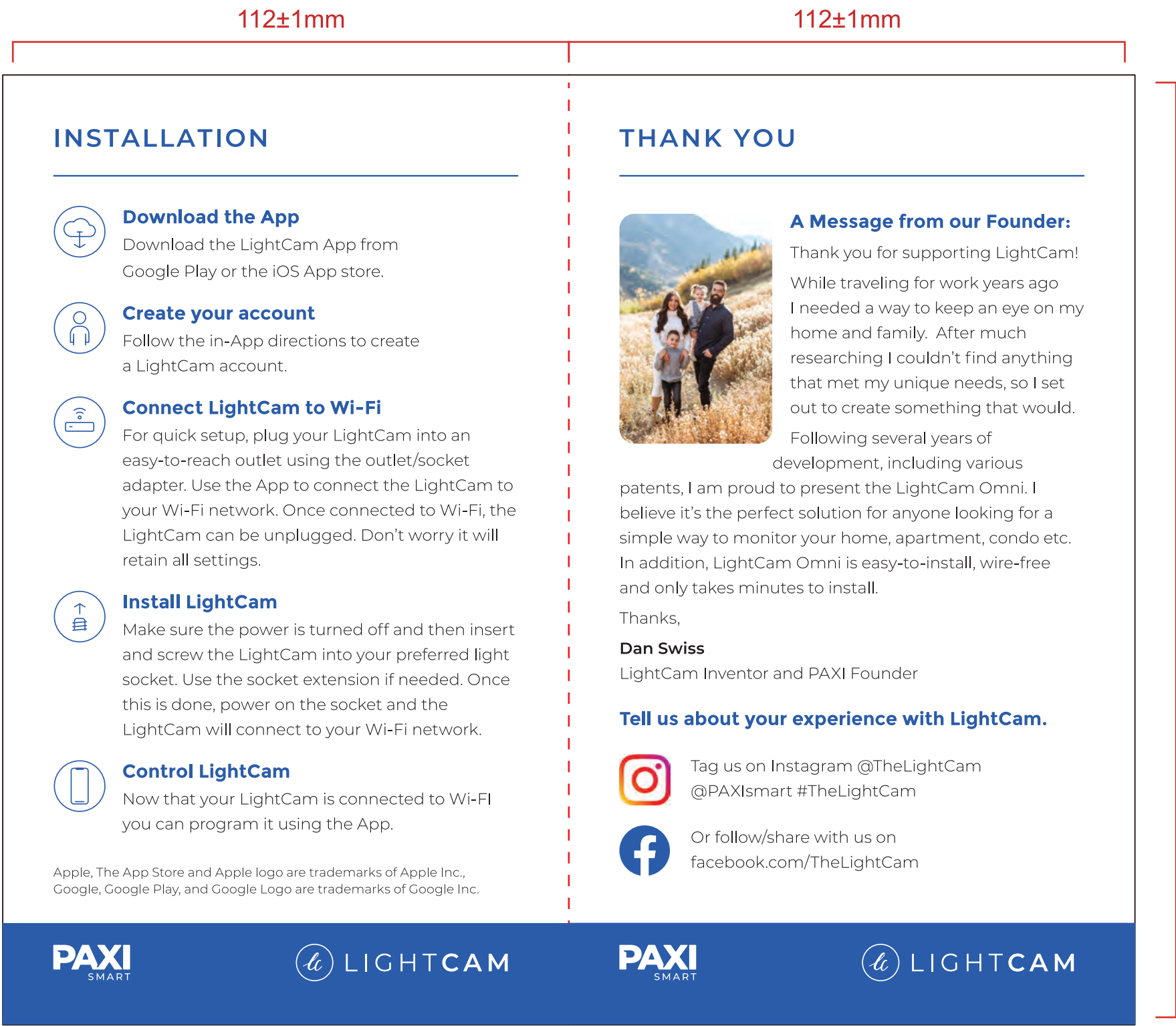
内页 ( 第2页 ) Inner ( page 2 )