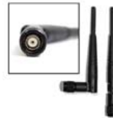
2.4 / 4.9 / 5.8 GHz Tri Band Rubber Duck RP-TNC