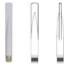
2.4 / 5 GHz Dual Band High Gain Omni Antenna N Male