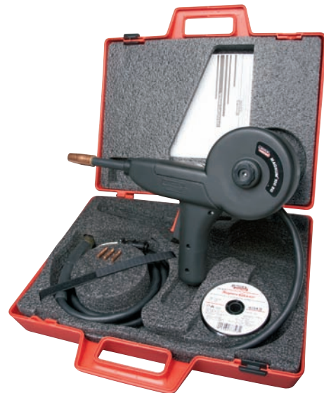
Complete Kit. No Bulky Module Required. Order K2532-1