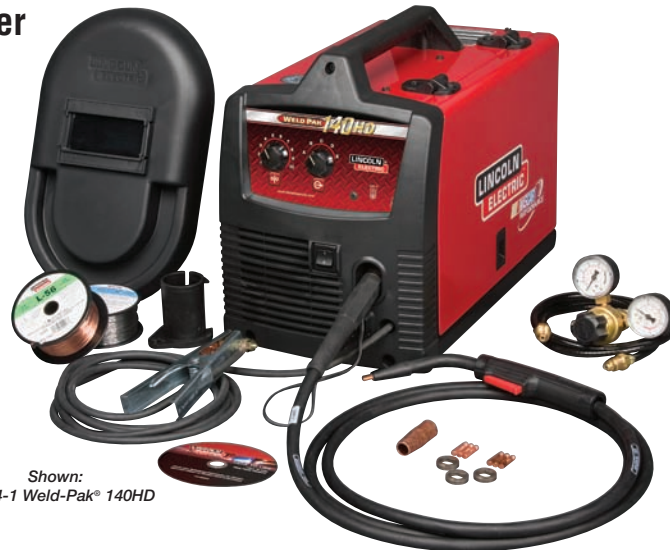
Shown: K2514-1 Weld-Pak® 140HD

Requiring common 120 volt input power, the Weld-Pak® 140HD can be used almost anywhere. With simple two knob tapped control, the machine is easy to set up for gas-less flux-cored welding for deep penetration on thicker steel or gas-shielded MIG welding on thin gauge steel, stainless or aluminum. Compare the precise drive, rugged construction and full list of standard accessories. . . Lincoln Weld-Pak® is an excellent choice!