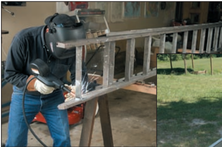
Great For Projects or Repair

Our low-priced spool gun is your most reliable aluminum feeding solution.