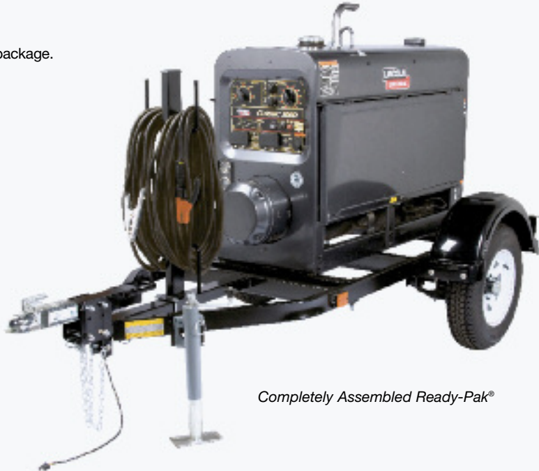
Completely Assembled Ready-Pak®