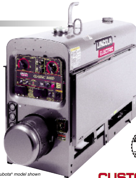
Kubota® model shown