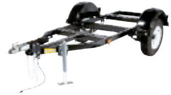
K2636-1 Medium Welder Trailer