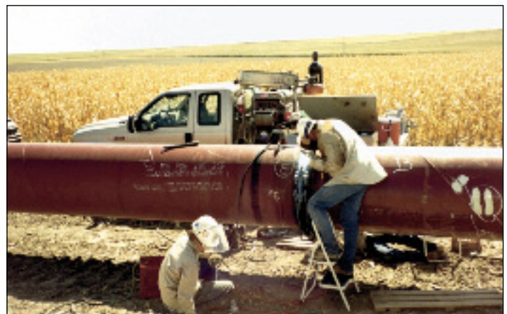
Cross-country pipe welding with Classic® 300D.