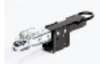
Duo-Hitch™ 2" Ball/Lunette Eye Hitch (included)