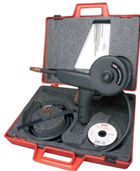
Complete Kit. No Bulky Module Required. Order K2532-1