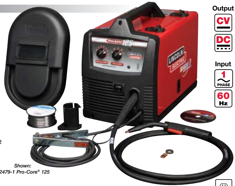
Shown: K2479-1 Pro-Core® 125

Plug in the Pro-Core 125 anywhere common 120 volt input power is available. Set the simple two knob tapped control for your material application and get it done. Right out of the box, the Pro-Core is set up for gas-less flux-cored welding so it's just right for common steel welding, indoors or out. Compare the precise drive, rugged construction and full list of standard accessories. . . Lincoln Pro-Core is a top quality tool for anyone with occasional welding needs.