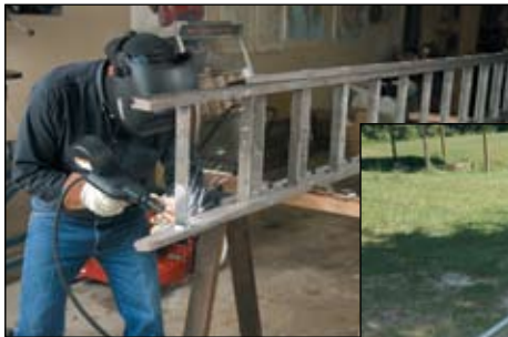
Great For Projects or Repair

Our low-priced spool gun is your most reliable aluminum feeding solution.