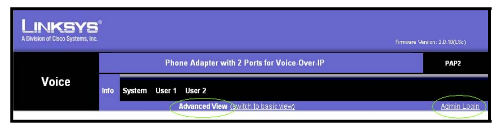
PAP2 Web Interface - Main Window

3. Click the System tab, and in the Internet Connection Type section, click the DHCP drop-down menu, and select yes or no .