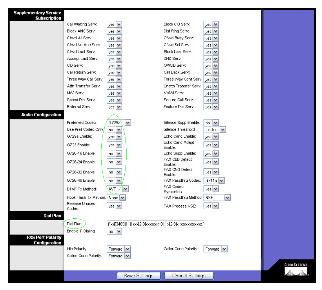
Audio Configuration and Dial Plan Sections