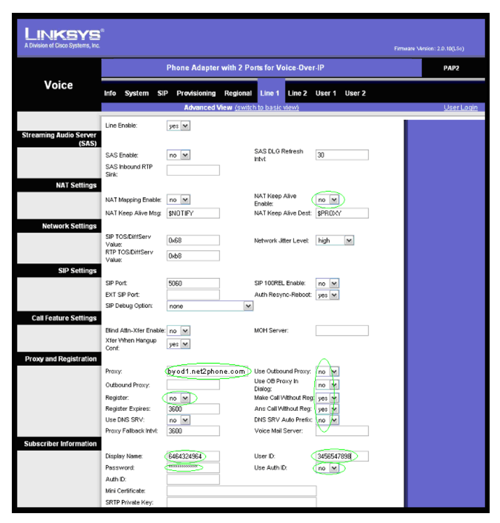
Proxy and Registration and Subscriber Information Sections

6. Scroll to the Audio Configuration section (as shown in the Audio Configurations and Dial Plan Sections screen on the following page), and change the following settings: