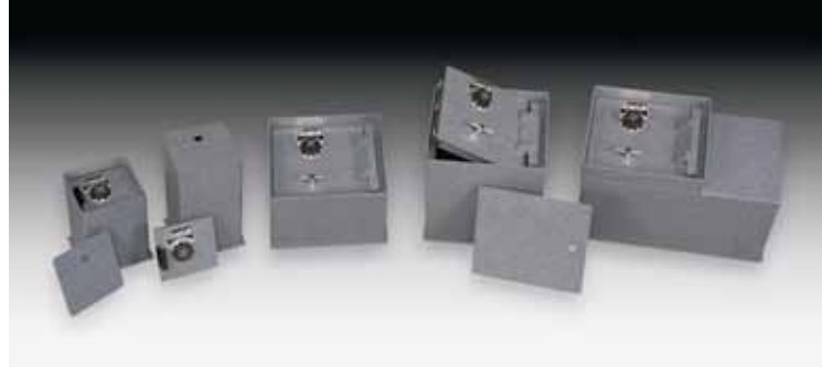
G500 G700 B1307 B1311 G3600

Drop slot available, add $175.00 retail.