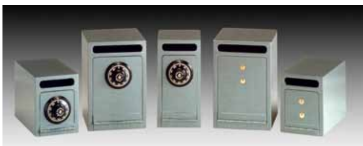
DS-86-C DS-1210-C TS-1206-C DS-1210-K DS-86-K

For mounting under store counters and placement inside delivery trucks or taxis. Ideal for church collections. Owners and managers maintain control as deposits can be made while door remains locked. Exclusive baffle design prevents contents from being removed through the opening. With independent relocking system. "B" rated, 1/2" door, 1/4" steel body. UL listed locks. Available with dual key, combination, or electronic. Standard Color: gray