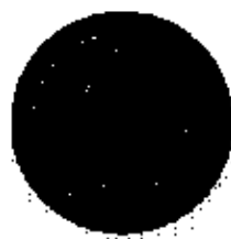
PS/2 mouse port