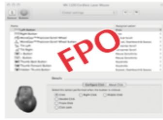
Logitech Control Center