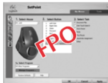
Logitech SetPoint Software