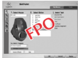
Logitech SetPoint Software