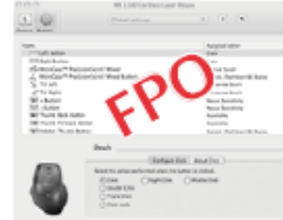
Logitech Control Center