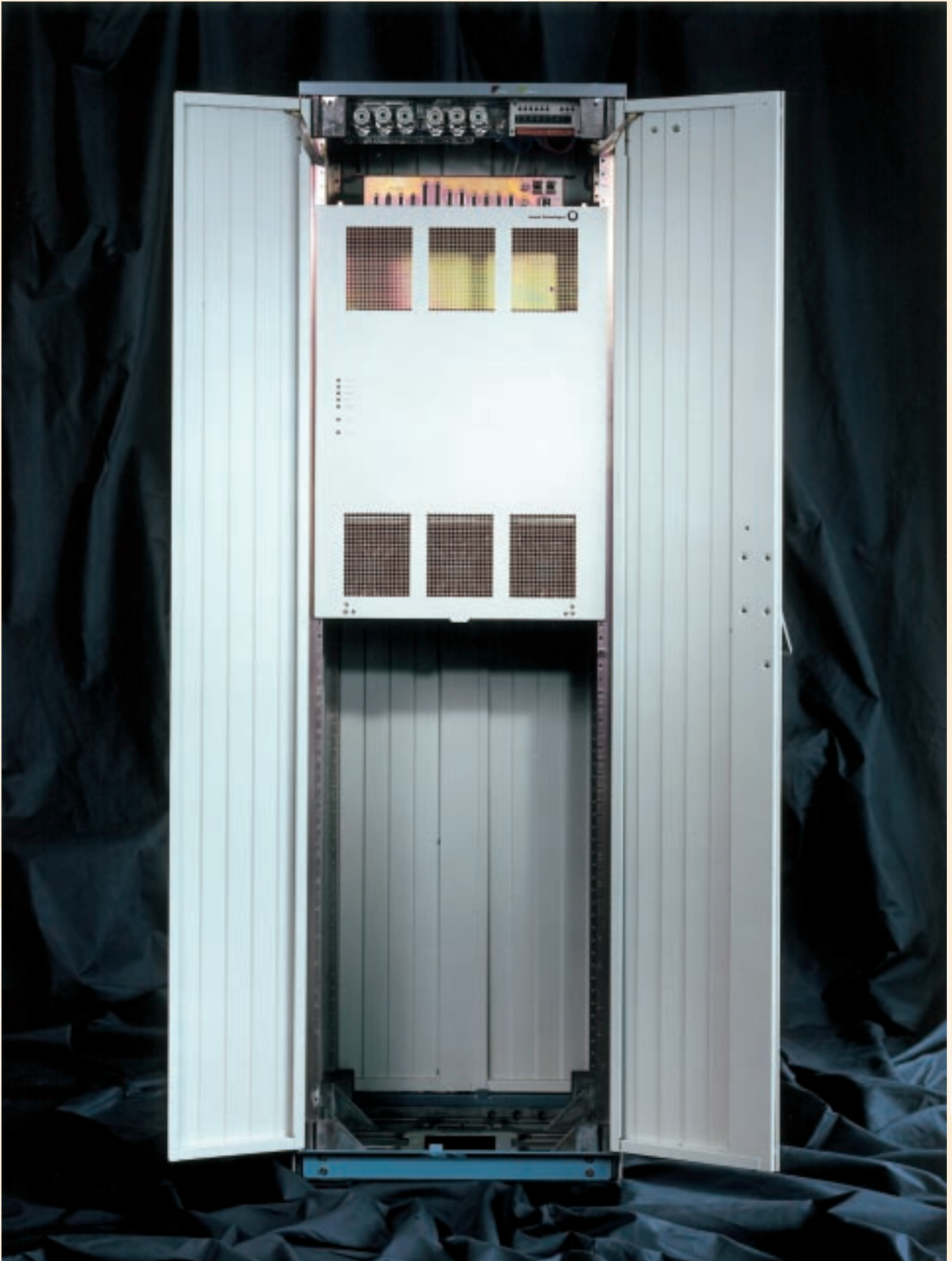
Figure 4: WaveStar ADM 16/1 Shelf in rack