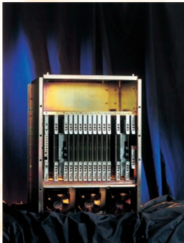
Figure 3: ADM 16/1 open shelf