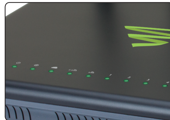
XWR-3100 Front Panel View