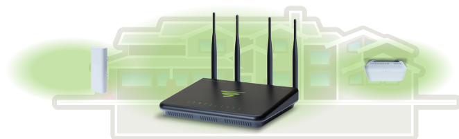
XWR-3100 as a Controller

The XWR-3100 can manage up to two additional access points to enable wireless client roaming and simple configuration. To enable this feature, ensure one or two compatible access points are connected to the same network as the XWR-3100, then select Wireless Controller from the XWR-3100 web configuration interface. Follow the online help to add the access point(s) to the profile.