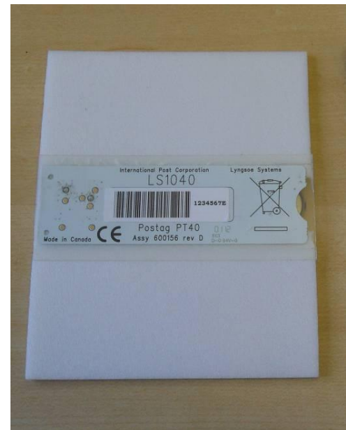
Figure 2 – PT40 Back side

Postag PT40 provides the following main functions: