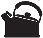
Enamel stainless steel kettle