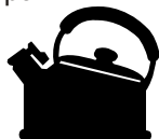
Enamel stainless steel kettle