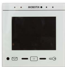
MOBOTIX MxDisplay MX-Display1-EXT (available in black or white)