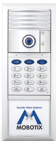
IP Video Door Station