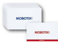
RFID cards for keyless entry