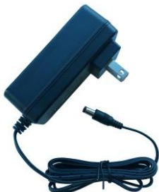
Power Cube (varies by country)