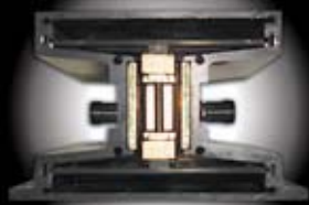
CROSS SECTION OF THE REMARKABLE I-BEAM™

the mechanical vibrations of the SubRosa's dual 10" High Back-emf woofers.