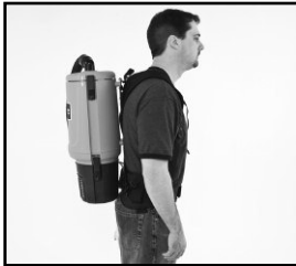
Adgility™ XP fits comfortably on the operator