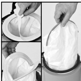
Full dust bag can be sealed before removal to contain all dirt