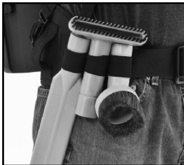
Accessory loops keep tools handy while operating