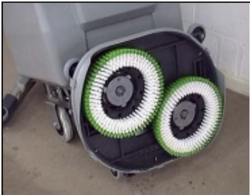
3. THE BRUSHES WILL NOW BE LOCKED IN PLACE AND READY FOR USE.

NOTE: WHEN USING A DRIVE BOARD FOLLOW THE SAME INSTRUCTIONS TO FIT DRIVE BOARD AND THEN FIX PAD CENTRALLY ONTO BOARD.