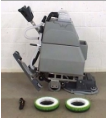
1. MACHINE SHOWN WITH BRUSHES.