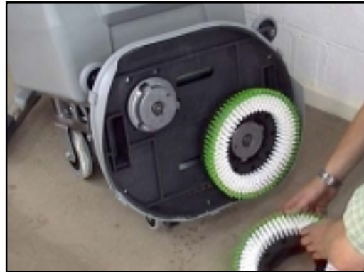
2. POSITION BRUSH ONTO THE GEARBOX WITH THE 3 INDENTATIONS ALLIGNING WITH THE 3 TABS. TURN ANTI-CLOCKWISE TO LOCK THE BRUSH IN PLACE.