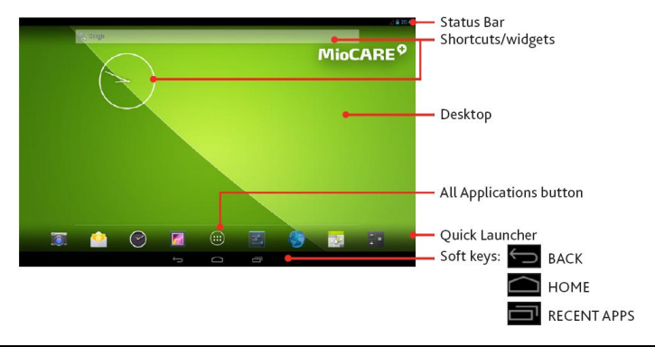
Tip: To display the Home screen, tap the HOME button at any time.

The Home screen is your starting place for tasks, providing quick access to frequently used applications and settings.