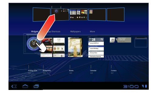
Drag the widget, shortcut, or other item to the home screen panel you want.