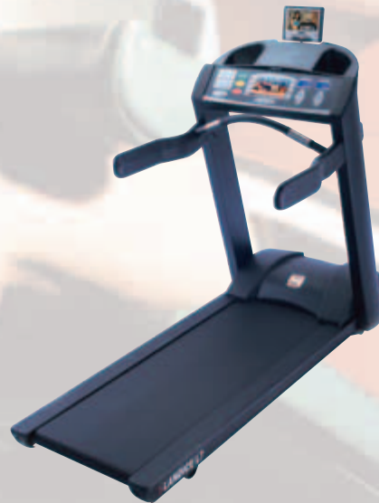
L7 Club shown in Matte Textured Black