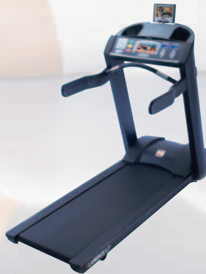
L7 LTD shown in Matte Textured Black