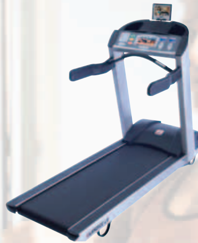
L9 Club shown in Titanium