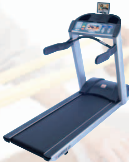
L8 LTD shown in Titanium