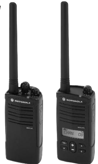
Dimensions: 4.5"H x 2.2"W x 1.6"D Weight w/Battery 8.6 oz, Color: Black