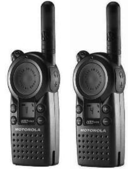
Dimensions: 4.1"H x 2.1"W x 1.1"D , Weight w/battery 5 oz., Color: Black