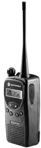
Dimensions: 4.5"H x 2.2"W x 1.81"D, Weight w/battery 11.5 oz., Color: Black