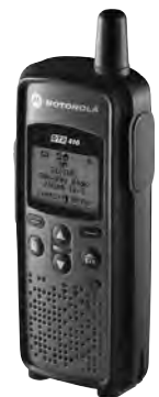
Dimensions: 5.2"H x 2.3"W x 1.4"D, Weight w/battery 7.3 oz., Color: Black