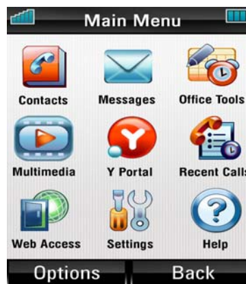
Figure 2: The W760r/VA76r display