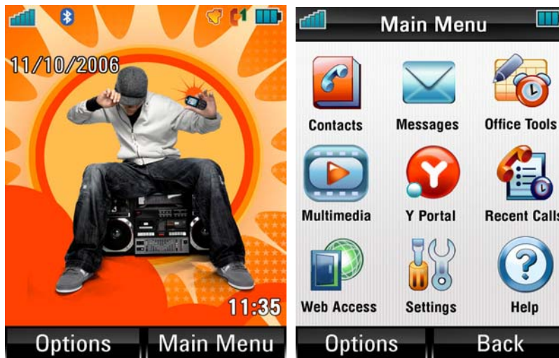
Figure 4: How wallpaper is displayed on the idle screen and main menu screen

Wallpaper images appear behind all screen elements on the idle screen and on the menu screen as shown in Figure 4.