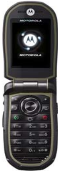
Figure 1: W760r/VA76r handset

This chapter describes the display characteristics for the W760r/VA76r handset.