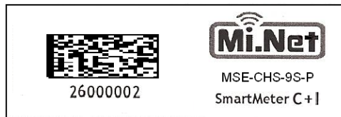
Figure 1. Product Identification Label

the Date of Manufacture, the Hardware Version and the MI.NODE-CI /Serial Number (Node ID) that is used to uniquely address the device and Assembled in Mexico.